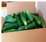
Cucumbers for sale at New Horizons