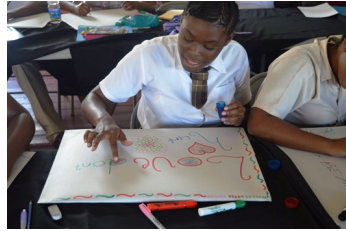
Participant at Youth Workshop