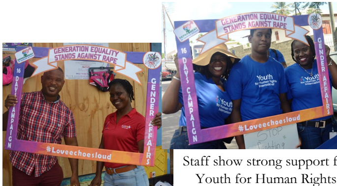
Staff show strong support for Youth for Human Rights March