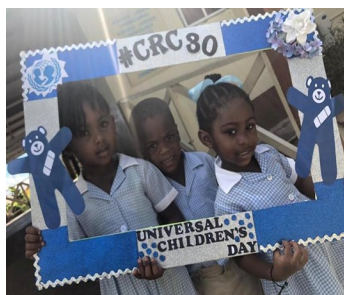
Children pose on Universal Children's Day