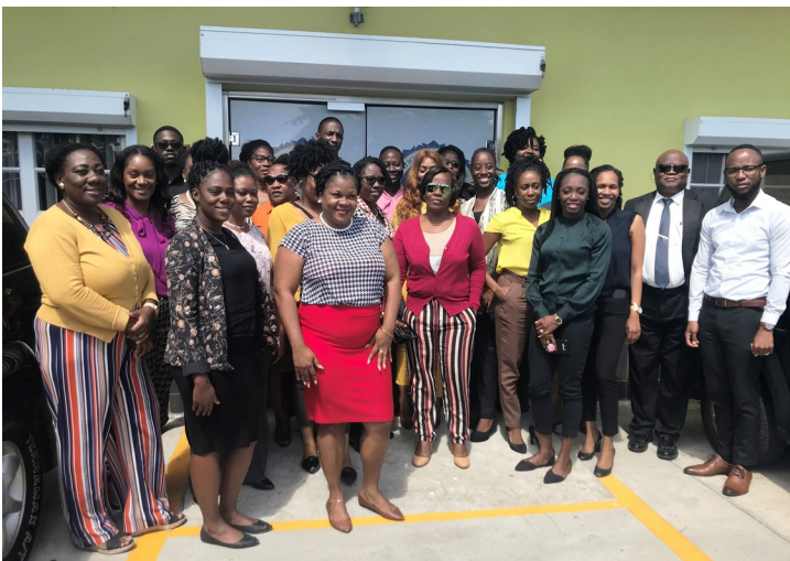
Students from the Saddlers Area donate time, energy and resources to the Saddlers' Home for the Elderly