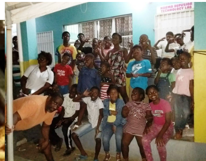
West Farm-Palmetto Point-Boys Community Movie Night