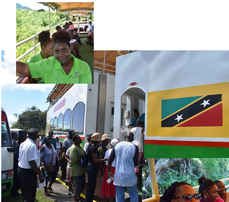
Seniors and Social Services staff enjoy a Scenic Railway Tour for Month of the Elderly