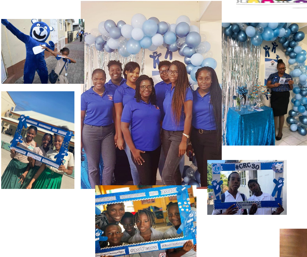
Child Abuse Prevention Week 2019