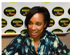
Counselling Director speaks on “Working for You” programme