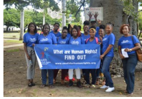
Youth for Human Rights March

Love Echoes Loud was the local theme for the 2019 16-Day Campaign on Gender-Based Violence, held from November 25 th to December 10 th , 2019.