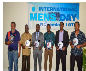
Men's Day Awardees