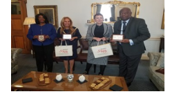
Delegates at Court hearing (above), and presenting their hosts with gifts of appreciation (below)