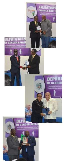
Awardees receiving plaques