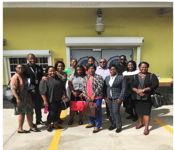
Staff and stakeholders in Juvenile Justice attend a workshop on the Therascribe software programme, at the ICT Centre