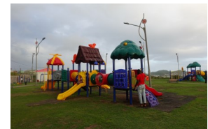
New Road Family Park

In a similar vein, the Honourable Minister Dr. Geoffrey