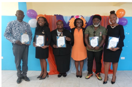
Gender Champion Inductees

Five 'Gender Champions' were recognized for their advocacy, volunteerism and provision of services to address the issue of gender-based violence, during a special Induction Ceremony held on Tuesday, December 6 th , at the Early Childhood Unit Conference Room, Victoria Road and hosted by the Department of Gender Affairs.