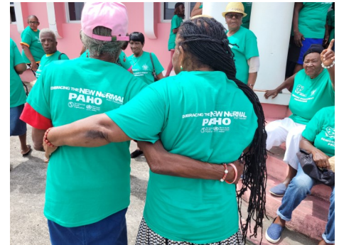
Seniors show off PAHO-sponsored shirts