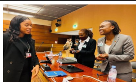
CEDAW Meeting, Switzerland

Ministry of Youth Empowerment, Ageing & Disabilities