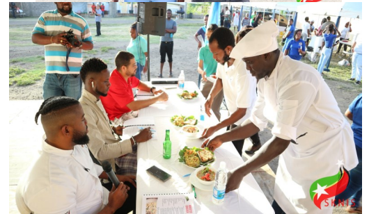
Men's Day "Buss a Pot" Challenge