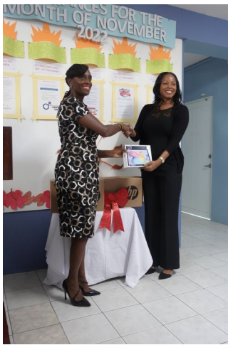
Bar Association donates to New Horizons Centre