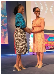
Presentation for Universal Children's Week

'Leading with Prevention, Creating Awareness, Promoting Alliances and Strengthening Communities' was the theme for Universal Children's Week , which was observed by the Probation & Child Protection Services Department during the week of November 20th-25th, 2022.