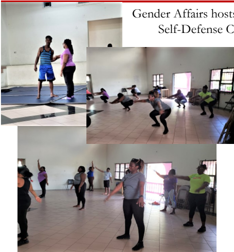
Gender Affairs hosts Women's Self-Defense Classes