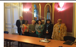
CEDAW Meeting, Switzerland

CEDAW is the Convention on the Elimination of All Forms of Discrimination against Women (CEDAW), which was adopted in 1979 by the UN General Assembly. It is often described as an international bill of rights for women. Consisting of a preamble and 30 articles, it defines what constitutes discrimination against women and sets up an agenda for national action to end such discrimination.