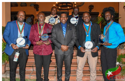
2022 Men's Day Awardees