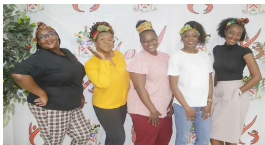
Some staff of the new Ministry