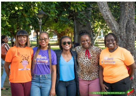
16-Day Campaign Against Gender-based Violence