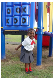
An excited Park goer gets ready to play!