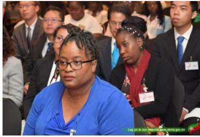
Permanent Secretary attends Women's Empowerment Forum