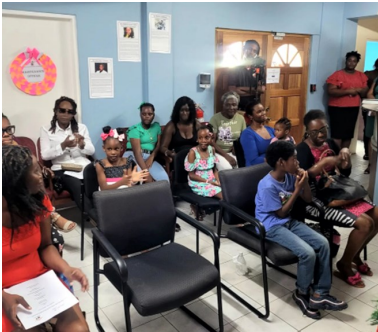
Rotary Club of St. Kitts brings Christmas Cheer to Foster families